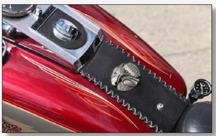
www.BIKE-AND-MUSIC-WEEKEND.de - Germany's biggest & best Motorcycle and US-Car Action event!