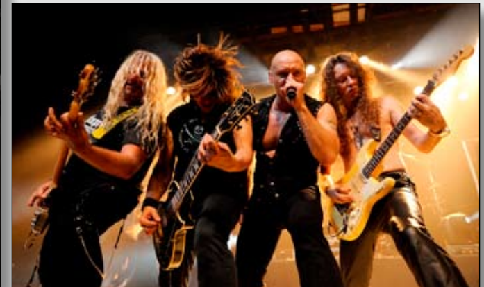
BIG IMAGE: Harley-Riders and visitors crowd at the main square of Bike and Music. Concerts, Bikeshow and vendors are open all weekend. TOP: The 2009 winners group shot. TOP: Rocket-powered Nightshow! BOTTOM: 2011 Special guests: PRIMAL FEAR