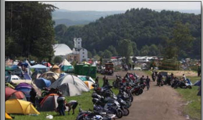
TOP: Motorcycle heaven for bikers of all brands: Bike and Music offers on-site camping and short ways to concerts and action!

Buell ace Erdős Csabas who performed at Geiselwind for the first time in 2009.